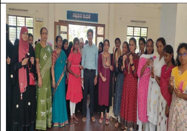
Students completed internship in Fashion Jewellery designing & making, Millenium fashion small scale Industry, Kurnool, A.P.