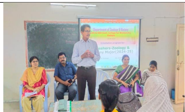
Bridge course to the freshers joined in BSc Zoology & Botany major programs.