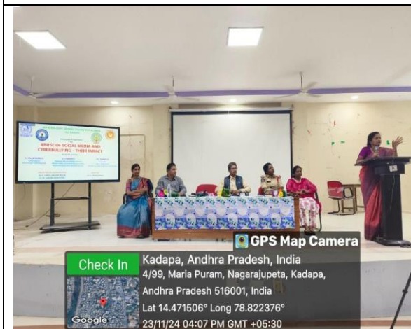
Awareness programme on Abuse of social media and Cyber Bullying their impact on 23.11.2024.