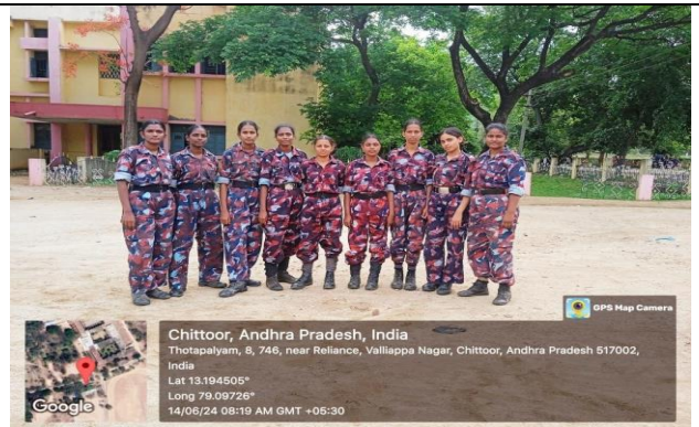
NCC Cadets selected to CATC-1 and participated in IUC- TSC (Inter Unit Competition- Thal Sainik Camp), organized by 35 battalion Chittoor from 11th June 2024 to 20th June 2024.