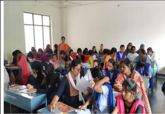
Group discussion on “Balancing Population growth and Environmental Sustainability” on 11-07-2024.

8. Advanced learners are encouraged to actively participate in group discussions, elocution, debates, JAM sessions, and poster presentations to enhance awareness of current affairs and to commemorate important days.