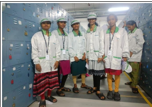
Students at the Wistron infocomm manufacturing (India) Pvt.ltd., Bangalore.

7. Industry internship is provided to the students to expose students to real work environment and to gain knowledge through hands on observation and job execution.