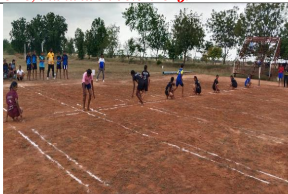
Students participated in the YVU Intercollegiate Kho-kho Tournament and secured 3rd place on 24.12.2024.