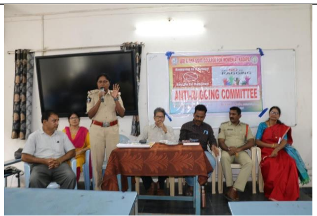
Awareness program on Anti ragging on 22-10-2024.