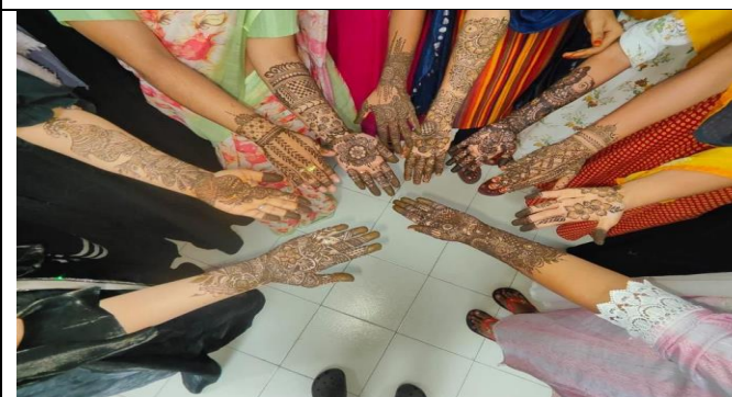
Mehandi Competitions on 27.09.2024 to promote cultural awareness and to showcase their artistic skills, creativity among students.