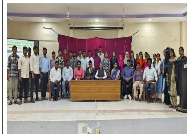
Campus drive by JKC on 17.02.2025 in collaboration with HDFC.