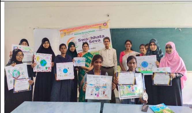
Painting competition on “Cleanliness is the way of Good health & Happiness” on 27-09-2024.