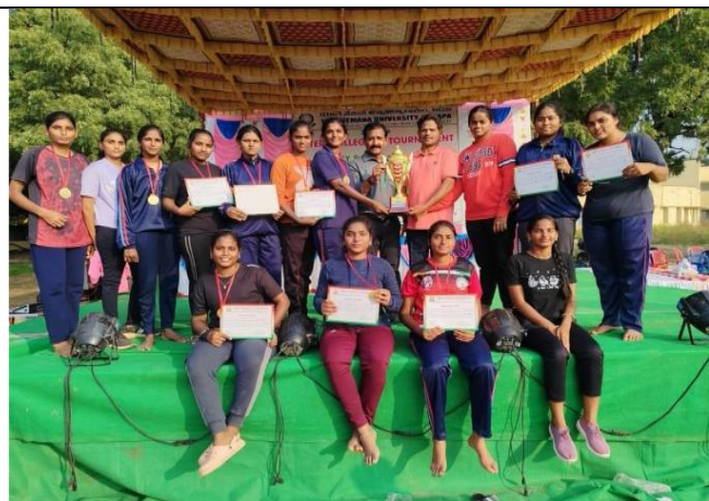
Students won the Tug of War Tournament, in the inter Collegiate Meet, YVU on 15.12.2024.