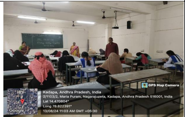
Essay writing competition on 13.08.2024 on the topic “Role of Women in Freedom struggle”.