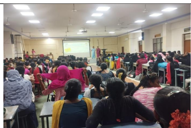
Awareness program to the freshers on certificate courses & internships.