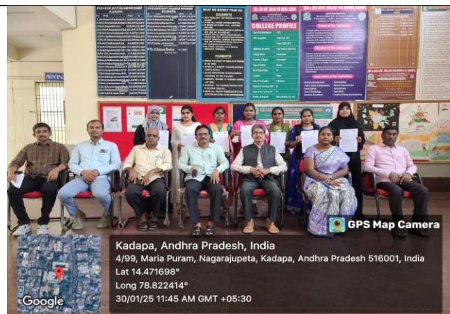
Final year students got placements in the campus drive at lepakshi Degree Colleg, Proddatur on 25-01-2025.