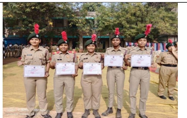
NCC Cadets attended All India Trekking Camp at Guntur from 16/01/2025 to 23/01/2025.