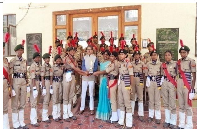
NCC cadets participated in Sanman Police parade at Police grounds, Kadapa and secured second prize.