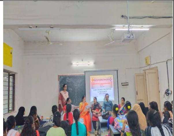
Quiz on AIDS-Causes, prevention & treatment on 30-11-2024.