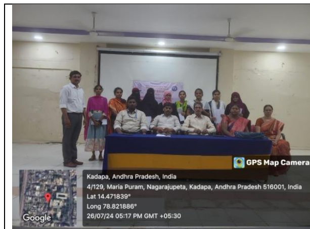
63 students attended and 13 members selected and got placement in ICICI interview on 26-7-2024.

10. JKC of the College consistently trains & encourages students to participate in job melas organized by the institution as well as by other colleges and universities, facilitating better employment opportunities.