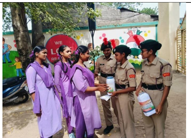
On the occasion of National Flag Day NCC Cadets collected fund on 07.11.2024..