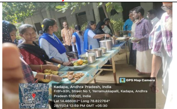
" HELPING HANDS" program by Dept. of English on 28-11-2024.students visited Premalaya old age home& served lunch for inhabitants.