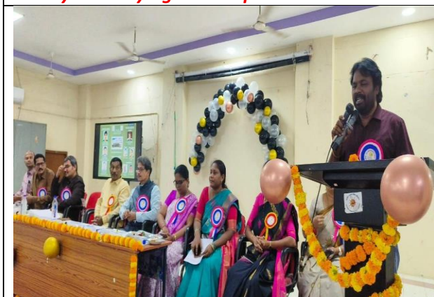
Workshop on Employability skills- need of the hour on 30-11-2024.